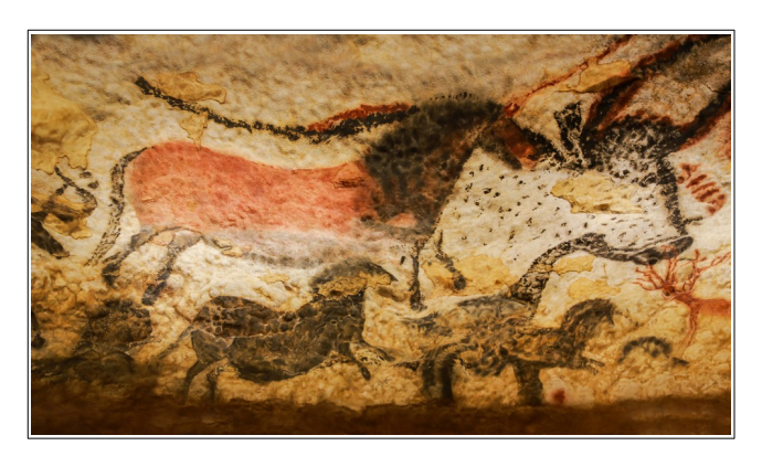
ancient cave art

Art is often used to deliver messages to the populous, whether literate or illiterate. This can be seen in medieval churches and in present-day _______.